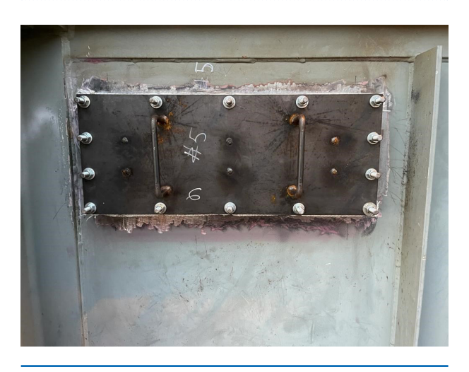
Figure 2. Example of access door install in progress.

Perhaps the best way to showcase the benefits of online cleaning can be demonstrated by a case study example. There are six main points to emphasise when considering an example refinery online cleaning project: